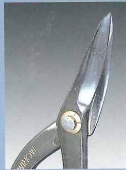
YANAGI-BA for copper sheets