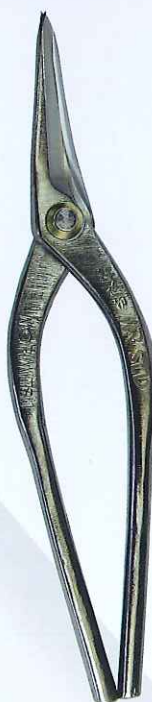
YANAGI-BA 210 for copper sheets