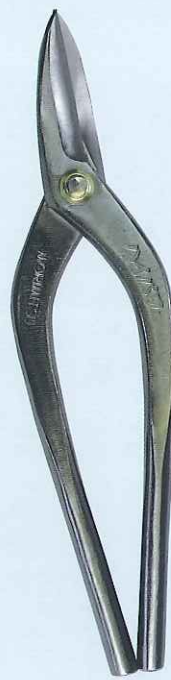
High-Power YANAGI-BA 240