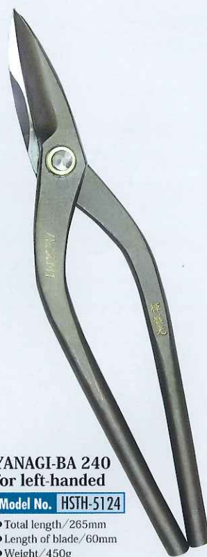
YANAGI-BA 240 for left-handed