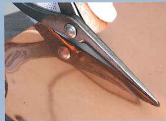
CHOKU-BA for copper sheets