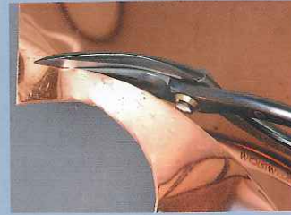
YANAGI-BA for copper sheets