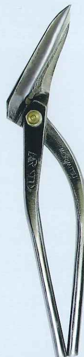
USUMONO CHOKUSEN-GIRI 320