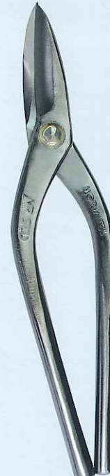
YANAGI-BA 240 for left handed