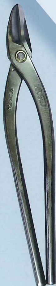
ATSUMONO YANAGI-BA 360