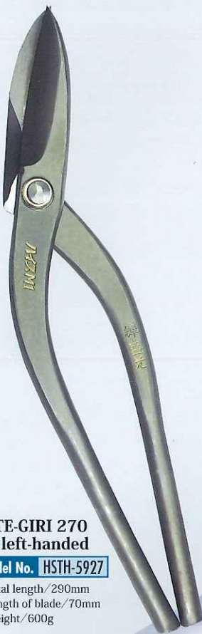
TATE-GIRI 270 for left-handed