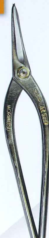
YANAGI-BA 240 for copper sheets