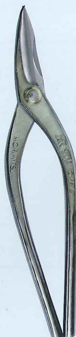
Slim YANAGI-BA 240