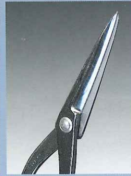
CHOKU-BA for copper sheets