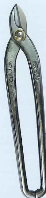
HAZE-W GIRI 240