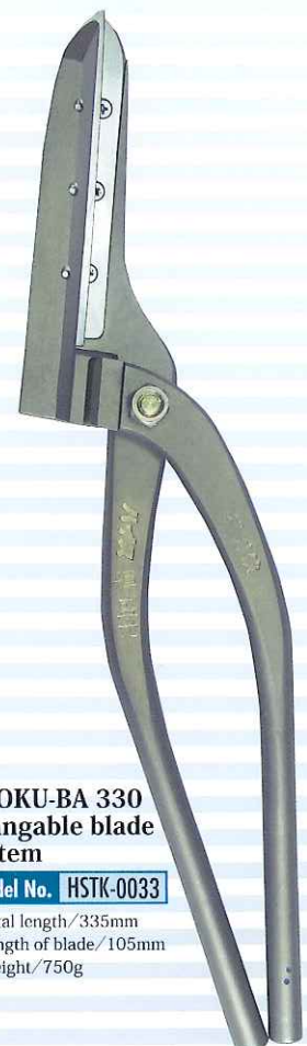
CHOKU-BA 330 changable blade system