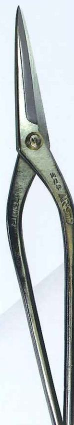
CHOKU-BA 300 for copper sheets